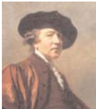
Sir Joshua Reynolds

▶ King George III reigned and although suffering bouts of insanity, bought Buckingham Palace and filled it with wondrous art from all over the world. On display as we speak. Note - He first met his wife at the altar!